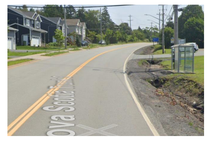
Saint Margaret's Bay Road