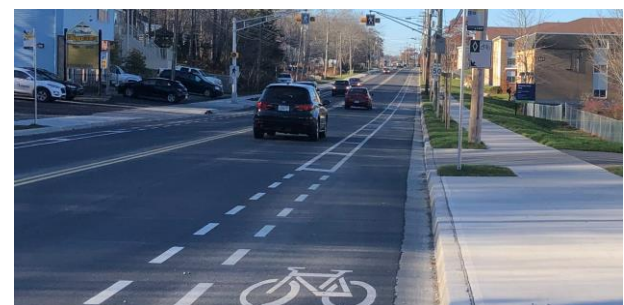
Herring Cove Road before and after