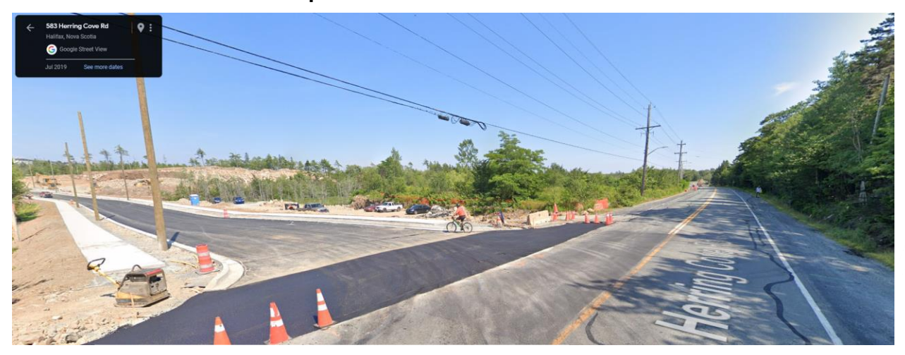
Herring Cove Road at Golden Way

Planning and Development currently exploring options to share the costs of new sidewalks where the need is generated by new development. This future need not included in this report.