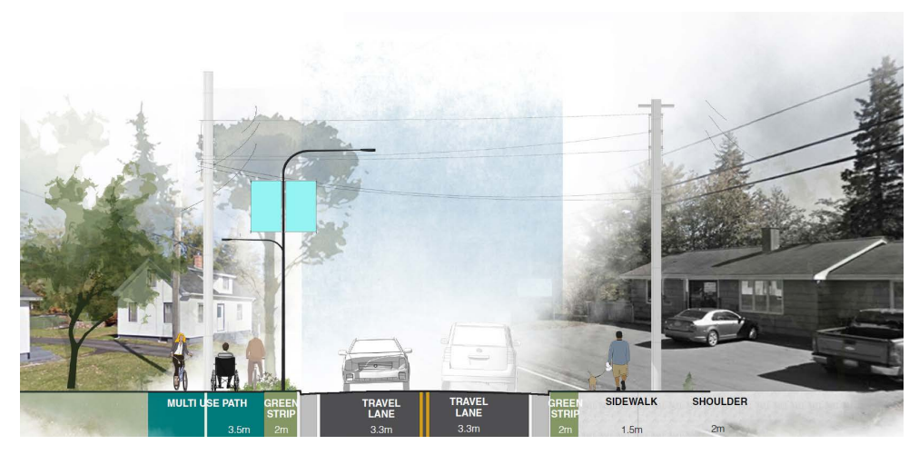
Example: Multi-use pathways and sidewalks in a rural community centre. (Hubbards Community Plan, p. 115)

Sidewalks and/or multi-use pathways in Hubbards are being considered in response to community requests and the implementation of the new HRM's Rural Active Transportation Program.