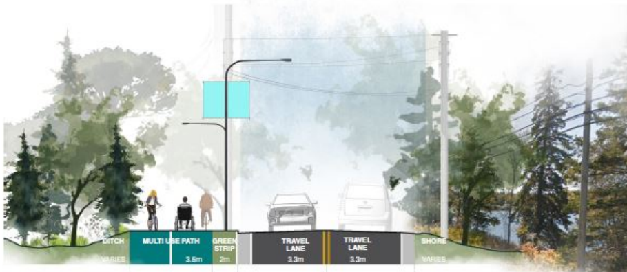
Example: Multi-use pathways and sidewalks in a rural community centre. (Hubbards Community Plan, p. 115)

Halifax Regional Municipality is conducting community engagement on the implementation of sidewalks and/or multi-use pathways in Lucasville. The facility which has been prioritized by the community is a multi-use pathway on Lucasville Road, known as the Lucasville Greenway.