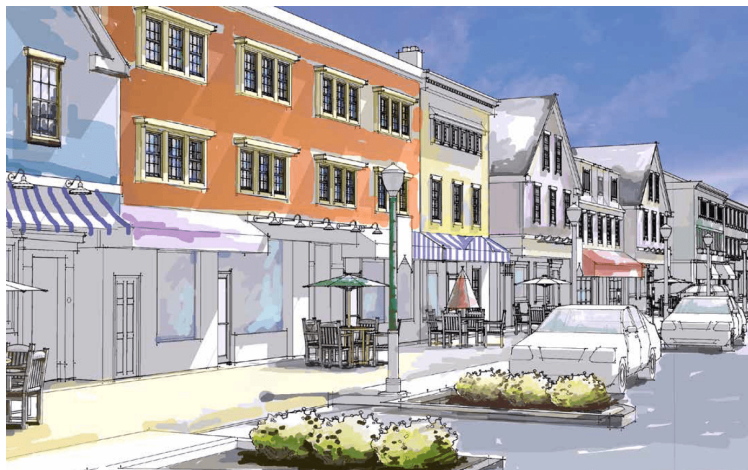
Example of a community centre with a sidewalk

Based on community requests and prioritization of rural community centres, adding a sidewalk or multi-use pathway to a portion of Trunk 7 in Musquodoboit Harbour is being considered.