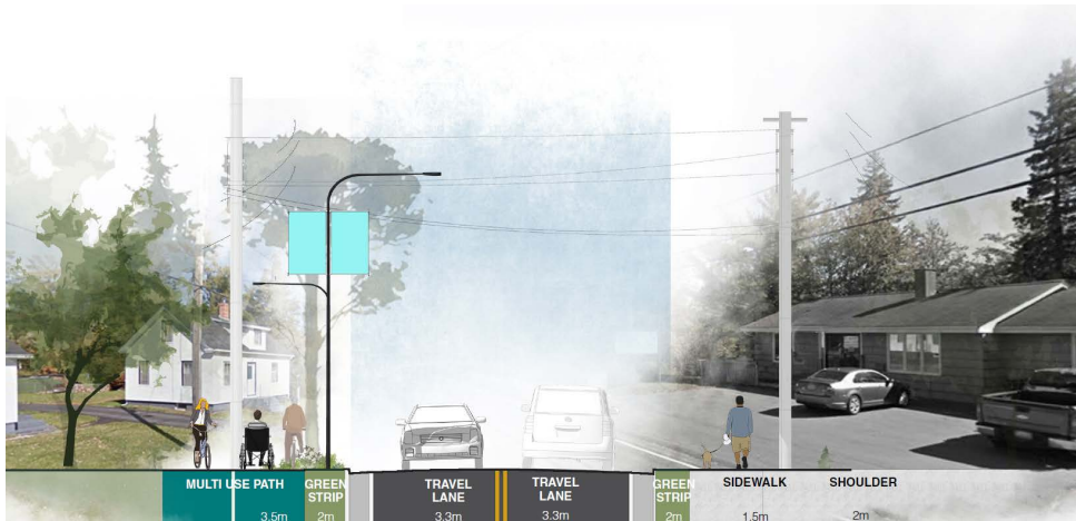
Example: Multi-use pathways and sidewalks in a rural community centre. (Hubbards Community Plan, p. 115)

Sidewalks and/or multi-use pathways in Upper Tantallon are being considered in response to community requests and the implementation of the new HRM's Rural Active Transportation Program.